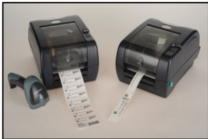
Label Station & Wristband Station

Easy To Read ~ No more unreadable imprints on your patient documents. You get crisp, clear labels and wristbands with or without barcodes anytime and anywhere you want.